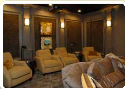
A home theater is situated on the lower level.