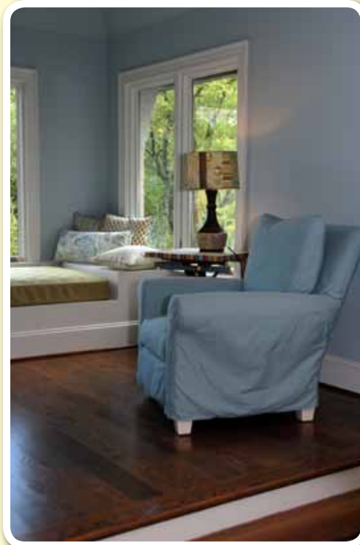
Off an upstairs bedroom, you step up to a cozy sitting room with a view.