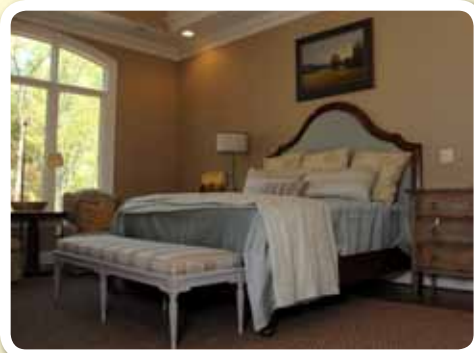
The master bedroom in the Joseph A. Houck house features panels of windows and a vaulted ceiling.

For more information: Gables & Gates, Realtors, 865-777-9191, or www.bridgemorelife.com or www.gablesandgates.com