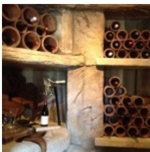
Stone and wood wine cellar.

The event runs from June 7-17 and is open to the public for a $15 fee at the door ($12 if you get the tickets in advance through www.HomeOfDistinction.com/12Indianapolis )