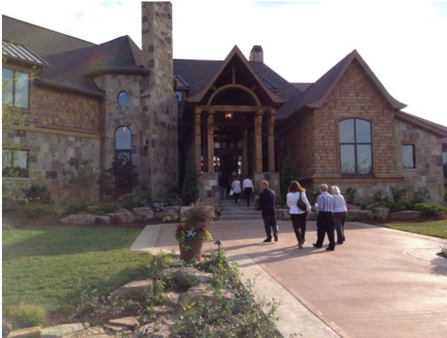
The grand entrance to $3.5 million home, one of two on the Homes of Distinction tour.